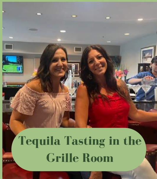
Tequila Tasting in the Grille Room