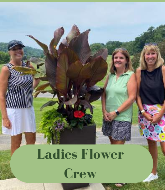
Ladies Flower Crew