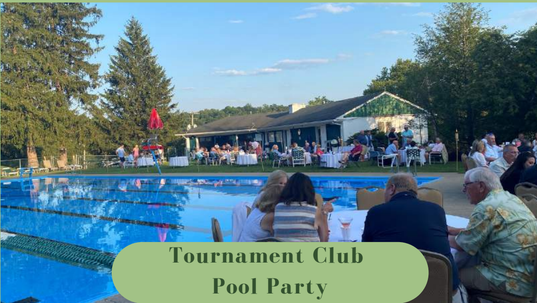
Tournament Club Pool Party