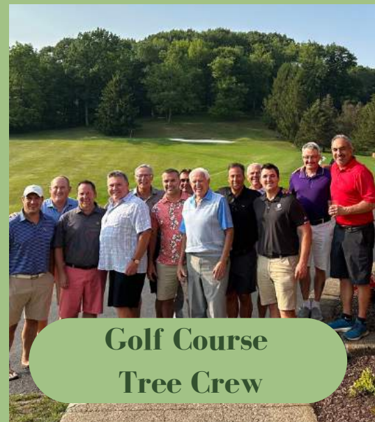
Golf Course Tree Crew